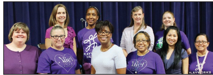
Cummings Elementary staff proudly wore purple during Purple Out Day to support Kerr High School.