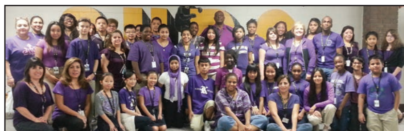
From top to bottom: O'Donnell Middle School staff and Alief ISD support staff in the Administration Building recently wore blue to support Elsik High School. Alief Middle School students and staff wore purple to show their support for Kerr High School.