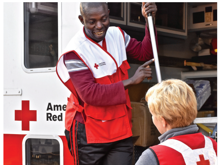
Volunteers ready a response vehicle for food distribution in Manning, S.C. About 24,000 Red Cross workers have mobilized for disasters in 2016, compared to about 7,800 for the same period in 2015.